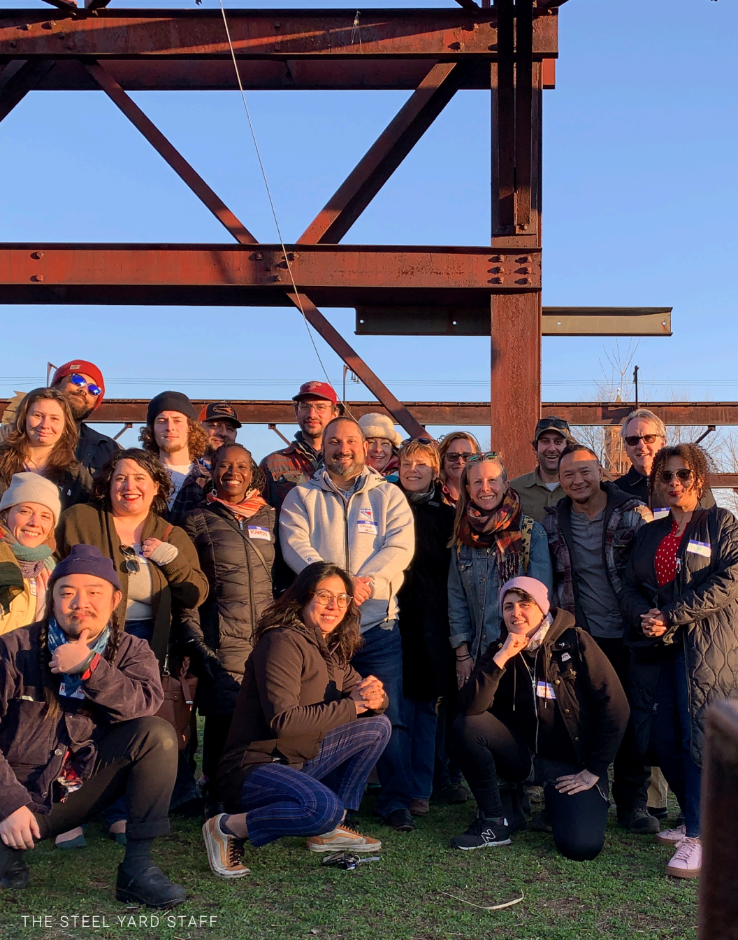
THE STEEL YARD STAFF