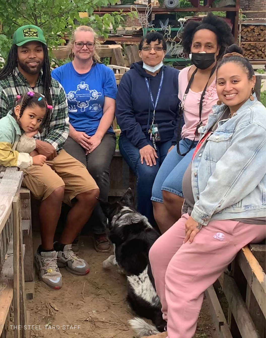
THE STEEL YARD STAFF